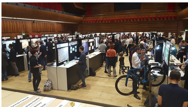
Plate 1. An image from the annual undergraduate student project fair. See Section 3.2

Both Master of Research (MRes) and Master of Science by Research (MbyRes) degrees are research-oriented master's degrees. Students dedicate significantly more time and effort to their thesis than in the cases of a third-year project or a taught (standard MSc) master's degree. This enables the pilot testing of a more substantial project. Funding opportunities can be used to attract high-quality students. The Knowledge Economy Skills Scholarships