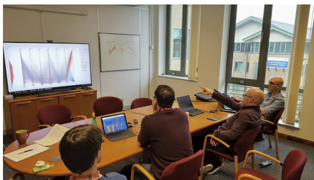
Plate 3. An image of our Innovate UK collaboration with QPC Ltd. See Section 3.10

The landscape of available grants is not fixed, successive governments may have different policies on research, therefore not all funding opportunities will be available in the future and