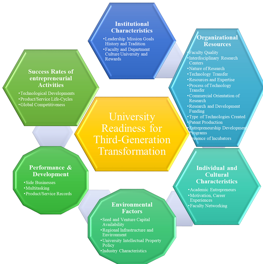
Figure 2. The readiness framework for transformation into a third-generation university based on influencing factors and quantitatively indicating its consequences on local economic development

industry characteristics are some of the external characteristics that impact readiness for the creation of a third-generation university.