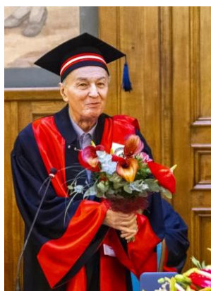
A Moment of Joy

Quo Vadis? When each of us is alone with our thoughts, in moments of intimate introspection, the ancestral question may arise in our minds: “Quo Vadis, Domine?” Where to? We ask ourselves: What should we do? How can we be better in the future? How can we, perhaps, do something that truly matters? Ultimately, what remains?