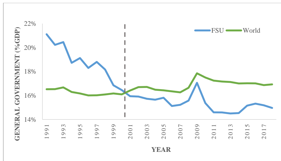
Figure no. 1. Size of government as % of GDP, FSU against world

It then becomes essential to understand what are the trends in terms of size of government and what kind of economic outcomes have been achieved by the post-Soviet countries since 1991. In particular, this paper suggests no general convergence neither in the size of government nor in economic growth. On the contrary, club convergence analysis identifies two clubs in terms of size of government and three clubs in terms of economic growth.