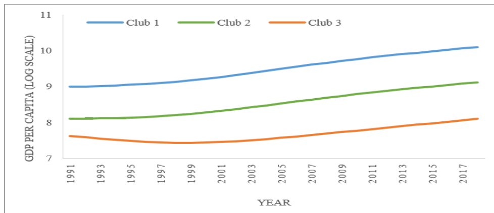
Figure no. 4. Club convergence analysis of economic growth in the FSU

Notes: Club convergence trends are calculated as a simple mean of trend components in terms of economic growth of all countries within each club, based on data from The World Bank (2020a).