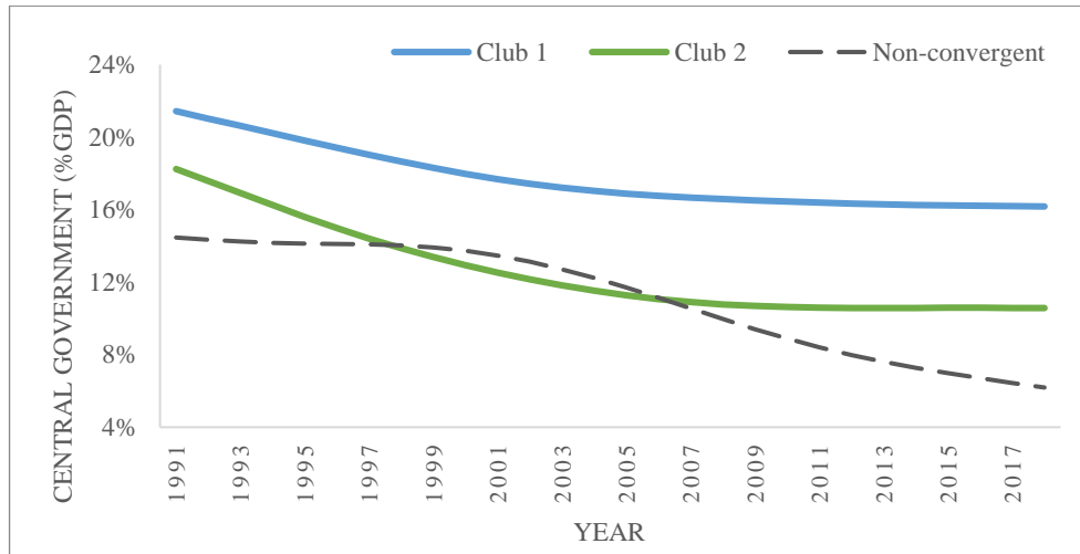
Figure no. 3. Club convergence analysis of size of government in the FSU

Notes: Club convergence trends are calculated as a simple mean of trend components in terms of size of government of all countries within each club, based on data from The World Bank (2020b).