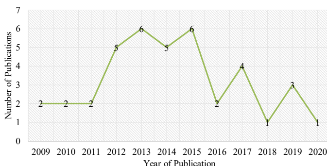
Figure 1. Yearly publications on drivers of ESS from 2009 to 2020

There are many drivers influencing organizations to adopt green initiatives in supplier selection process. A thorough understanding of green drivers is essential since it aids organization in deciding on the measures to be taken ( Etzion, 2007 ). Drivers are defined