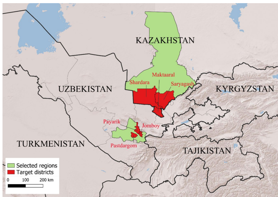
Fig. 1 Research districts in Turkistan region (Kazakhstan) and Samarkand region (Uzbekistan).

the southernmost region of Kazakhstan, bordering Uzbekistan. Both regions are dominated by irrigated agriculture. In Kazakhstan, a regional specialization pattern defined that farmers in southern regions specialize in vegetables and horticulture (Kvartiuk and Petrick 2021). These irrigated areas are close in their farming system to Uzbekistan, where post-Soviet crop specialization has been retained, with cotton staying as a dominant cash crop.