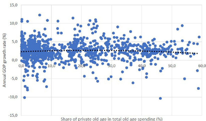
FIGURE 1 Share of mandatory private and voluntary private old age spending in total old age spending and annual GDP growth rates for OECD countries from 1980 to 2020. [Colour figure can be viewed at wileyonlinelibrary.com ]

between the degree of fundedness and economic growth may be inverted U-shaped if bequests are not operative within the family. In response to a gradual increase in funding individuals substitute private savings for educational spending as a result of a lower pension benefit from the unfunded part of the social security system. If this direct effect through lower educational spending dominates the positive general equilibrium effect resulting from higher capital accumulation and therefore a higher return to education, a gradual increase in the degree of fundedness reduces growth. When bequests are operative, however, our results are consistent with previous results in the literature as a higher degree of fundedness is beneficial to growth. In this case individuals substitute voluntary savings for consumption spending to provide a larger amount of bequest to their offspring which in turn increases aggregate savings and capital accumulation.