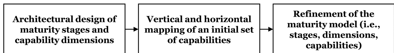
Fig. 2 Twin Transformation Capability Maturity Model Development Process

Refinement of the Maturity Model (i.e., Stages, Dimensions, Capabilities). The iterative maturity model development process was completed by conducting five