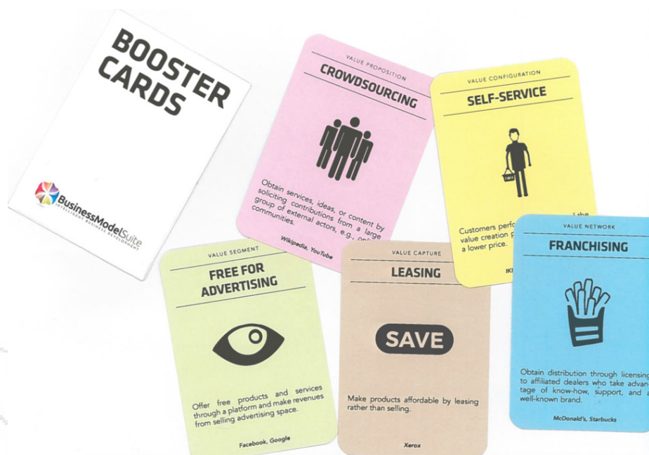
Figure 1: Examples of booster cards.

The cards are based on 71 different BM configurations identified in the work by Taran et al. (2016). Each card in the deck represents a specific configuration and contains a short description of the configuration and real-life example to strengthen the analogy further. The description might give room to gain context-free ideas, but if the students are having issues with generating ideas or understanding the concept, the real-life examples often spur them in the right direction. An example can be found in Figure 1, where the configuration 'Free for advertising' provides both a short explanatory text of the general concept and empirical references (in this case of Facebook and Google).