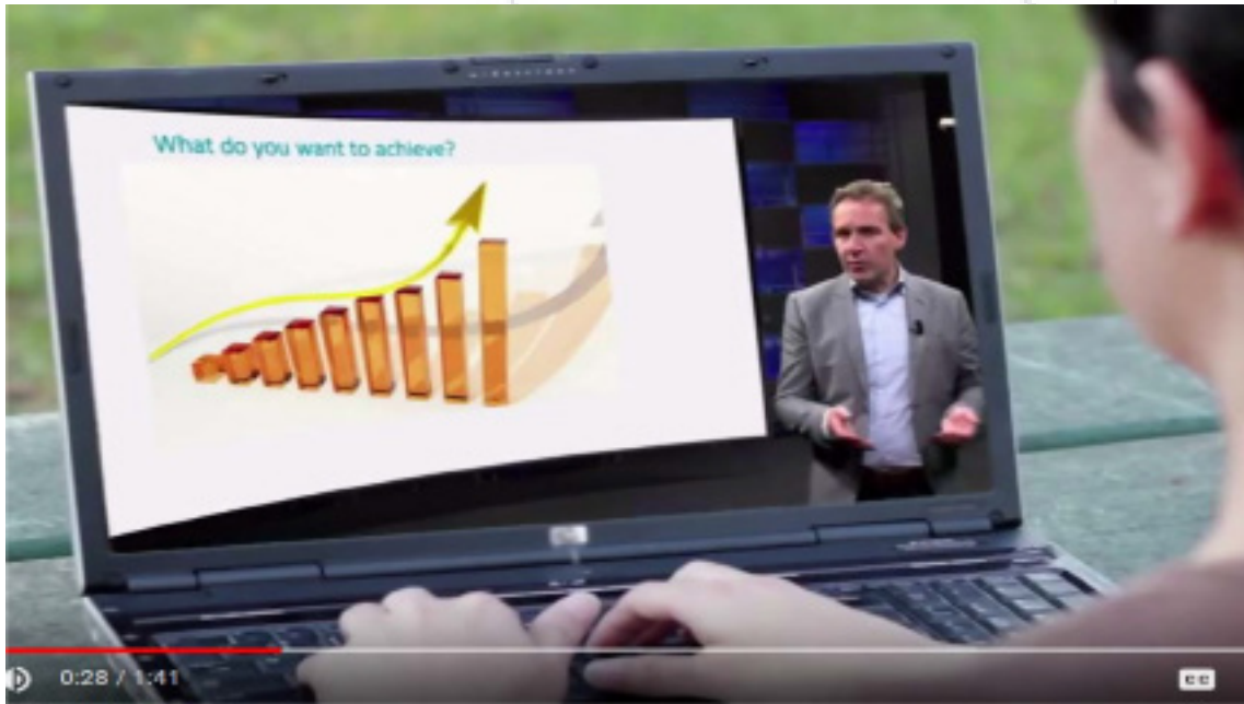
Figure 3: Screenshot of online learning video

contents in their own language. A screenshot of a video is provided in Figure 3.