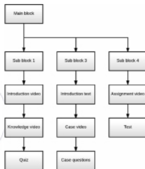
Figure 2: Structure of a typical course

Videos were recorded in a professional studio. Video clips were typically less than 6 minutes. All videos and cases were provided in English and subtitled. Subtitles were translated into German, Spanish, Italian and French, assuming that SMEs would appreciate the