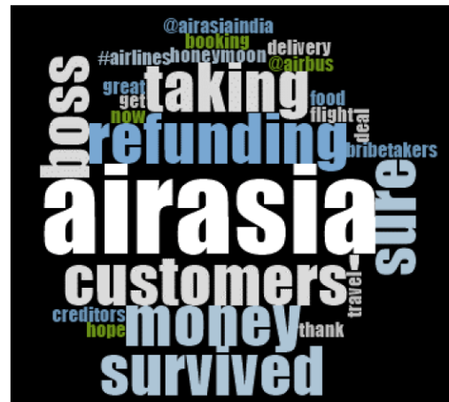
Figure 5 Word Cloud Analysis for Positive Sentiment Tweets for AirAsia