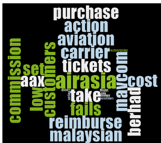
Figure 4 Word Cloud Analysis for Negative Sentiment Tweets for AirAsia