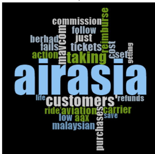
Figure 3 Word Cloud Analysis for AirAsia

Verbs also appear repeatedly in the three word clouds, including "taking" and its stem word, "take". "Take" means "use or ready to use". If "take" is combined with "action", it means to do something for a particular result. Some goods or items are also listed in the word clouds, such as "ticket" and "money". In the airline industry, a ticket is a proof that a passenger is entitled to a seat on a flight, and it can be paper or electronic. "Money" is a medium of exchange that allows people to obtain what they need or want. Word clouds visually represent passengers' thoughts. The most popular topic of discussion among AirAsia passengers was the refund issues due to flight cancellations during the COVID-19 pandemic. During the pandemic, AirAsia cancelled all flights but did not refund customers' tickets. After a few months or a year, passengers hoped MAVCOM would act against AirAsia to return their money.