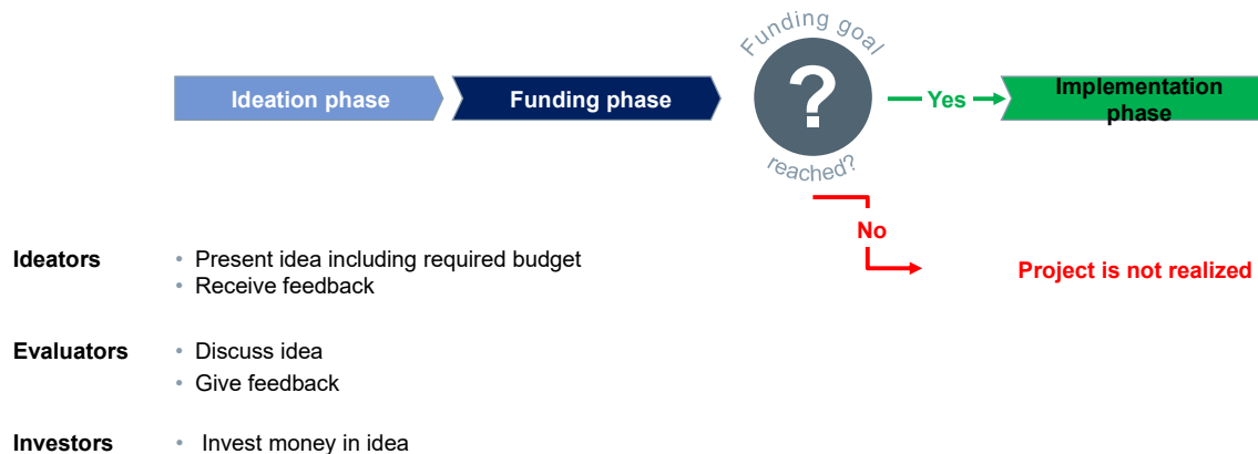
Figure 1. Siemens' internal crowdfunding process

But the crowdfunding journey involves more than just these phases; it also involves careful design considerations that underpin them. We will now shed light on three crucial questions that managers need to answer if they want to make the most of internal crowdfunding.