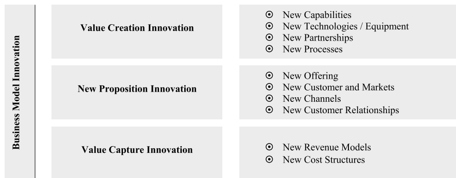
Fig. 1 BMI Categorization (own illustration following Kraus et al. (2022b))

The model delineates three categories of BMI. First, in terms of “value creation innovation” technological advancements play a pivotal role in driving BMI (Clauss 2017). Companies striving to gain a competitive edge must continuously innovate through the adoption of new technologies or processes (Needleman et al. 2021). This necessitates the acquisition of expert knowledge of the new technology and its broader context (Desai et al. 2014). Regarding AI, companies must be adept at integrating technical innovations into an existing landscape. Second, “new proposition innovation” of BMI is driven by the emergence of new markets and sales channels, requiring organizations to adapt their internal and external communication processes (Needleman et al. 2021). The introduction of new products and services through BMI necessitates changes to the existing strategy of a company, which entails modifying both the technical implementations and process structures simultaneously. Last, the expansion of revenues is a significant driver of BMI in “value