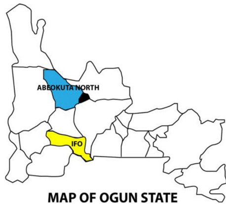
Fig. 2 The local governments in Ogun State selected for the survey

the area at a 95% confidence level and with a margin of error of 0.01 is about 160 respondents (Bavorova et al., 2021). In the second stage, in each of the two local governments, five communities were conveniently selected for accessibility. In each community, about 30 respondents were selected using snowball sampling, resulting in 156 farmers (heads of smallholder farms). All farmers interviewed for the study are plantation farmers, the plantation includes cocoa, plantain, and oil palm. The majority of farmers combined their plantations with food crops such as maize, cassava, and vegetables.