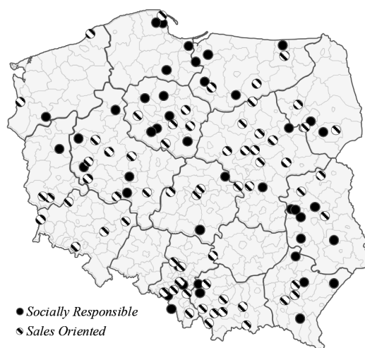
Figure 2. Geographical distribution of head offices of SLBs following the two represented Facebook activity models

The analysis begins with a k-medoid clustering, which allows to identify the unique Facebook activity models of SLBs. The results of the clustering are presented in Table 3. Two clusters of banks are distinguished. The first includes 64 banks that devote their Facebook activities mainly to describing product offers: the medoid – a group representative – conveys product offers in 40.3% of its posts. Taking into account that an additional 8.9% of posts are advertisements that do not reference the bank's products, almost 50% of posts of this cluster's medoid have an economic connotation. Additionally, banks within this cluster inform their Facebook followers about charitable, social, or local issues to a minor extent. Taking these specificities into account, banks from this cluster are called Sales-Oriented. The second cluster is constituted of 44 SLBs. The medoid of this group conveys information about charitable activities in 9.4% of posts, 21.5% of posts are devoted to the bank's social issues, and 13.4% convey local news. Thus, 44.3% of posts can be treated as a representation of socially responsible disclosures, as compared to only 21.4% of such posts published by the medoid of the first