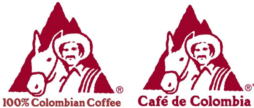
FIGURE 1: Ingredient brand

sumers (particularly North Americans). This forced the brand to develop a strategy that would create an elegant and premium product. Therefore, the ingredient brand 1 was launched (Figure 1) to allow distributors, roaster companies, restaurants and hotels to use it, and in that way conferring added value to the product (Reina et al., 2012).