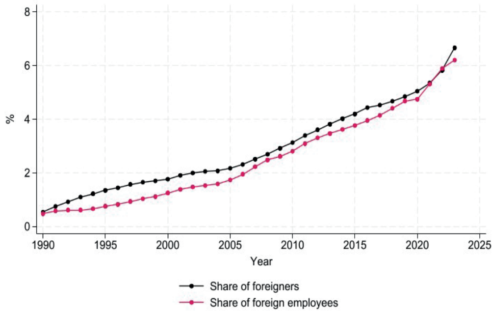
Figure 1: The share of boreign-born in Finland, 1990-2023 (Source: Statistics Finland)

permits were issued as follows: 25% for family-related applications, 25% for international protection, 20% for employment, and 16% for education. The remaining permits covered EU citizen registrations, remigration, refugee quotas, and other categories (Finnish Immigration Service 2024). The distribution of foreign-born residents across Finland's 19 NUTS 3-level regions is uneven. As of 2023, Åland had the highest proportion of foreign-born inhabitants at 12.2%, followed closely by Uusimaa (the capital region) at 11.5%. In contrast, Central Ostrobothnia had the lowest percentage at just 3.1%.