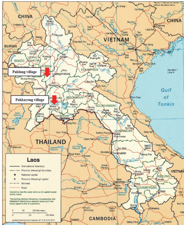
Figure 1. Map of Field Survey Research Area in Lao PDR

Note: The marked areas are Paklung village and Pakkayong village.