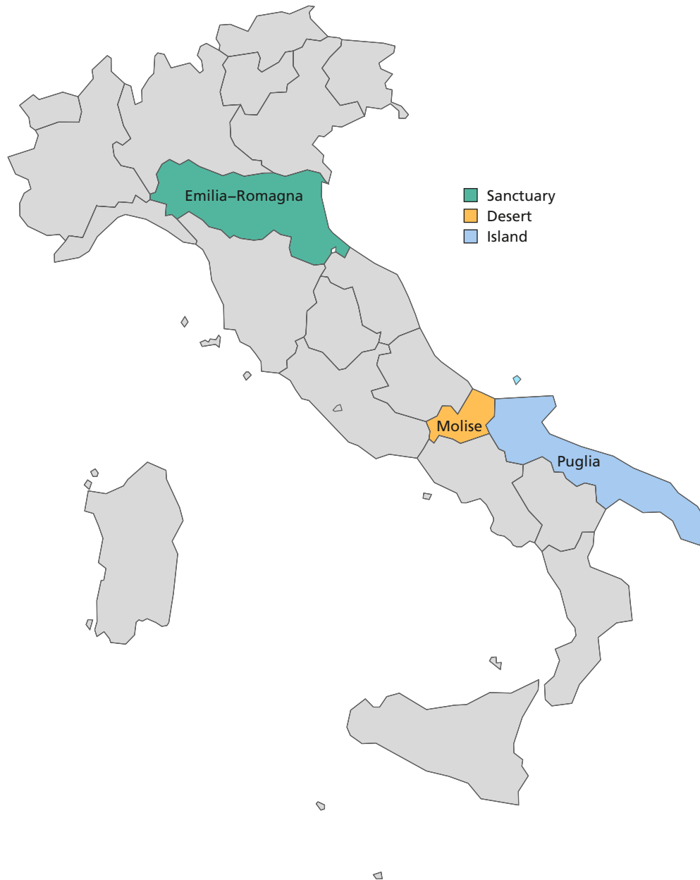
Figure 2 Map of Italian regions referenced

Map produced by authors using Shapefiles from GISCO, © EuroGeographics for the administrative boundaries, using R package tmap (Tennekes 2018).