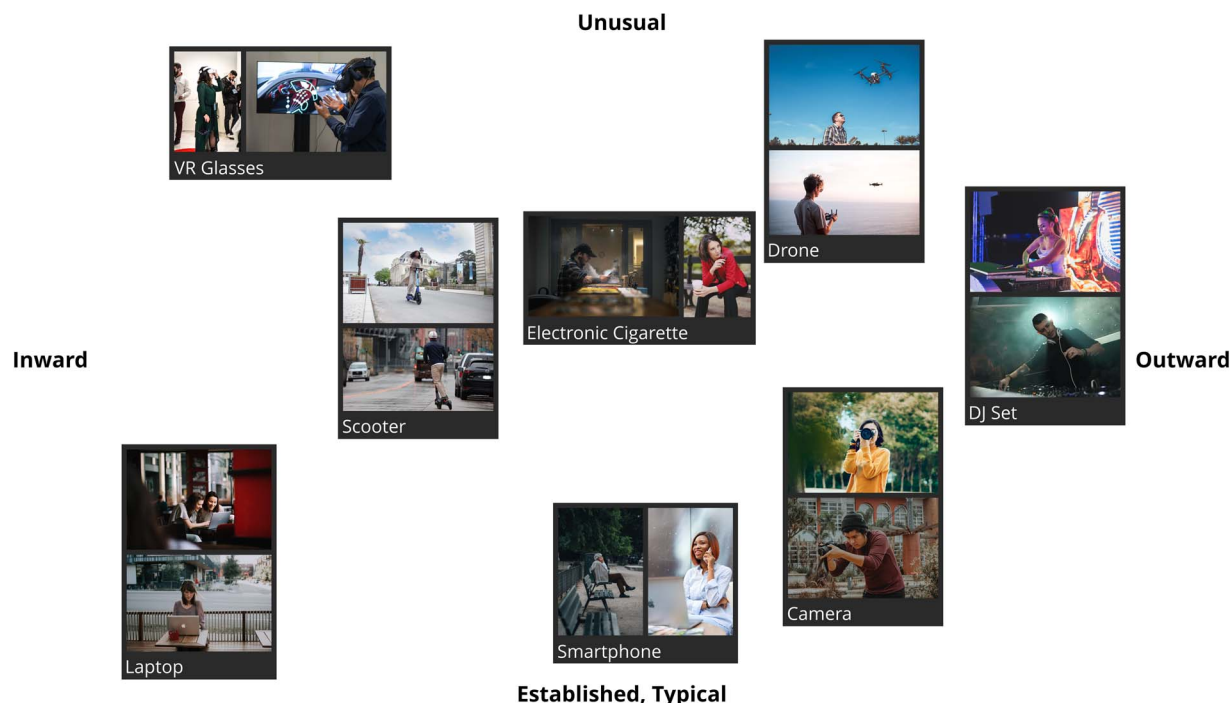
Fig. 3. The eight example technologies used in the study, roughly aligned on the two axes from “inward” to “outward” orientation, and from “established, typical” to “unusual”. The photos in the figure are the ones used as illustrative material in the study.

Uhde et al., 2025, or supplementary material for details about the template development).