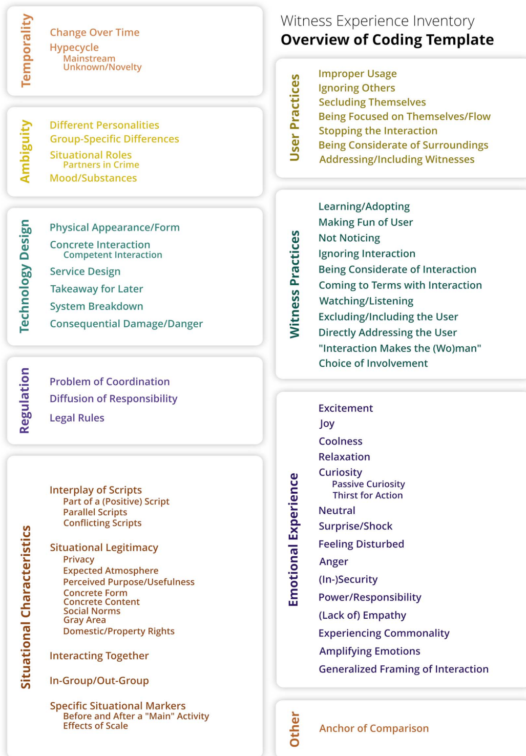
FIG. 4. Overview of the themes, subthemes, and subsubthemes of our analysis, which are included in the coding template. See Uhde et al. (2025) or the supplementary material for full code descriptions and further details.

A different type of ambiguity relates to the different social roles of witnesses. One participant described how he was responsible for setting up VR glasses to attract potential new employees during a job fair. The candidates could use the VR glasses and others could watch them. But his own witness experience was different because of his role: "if I am part of the crew at the stand, I need to make sure that nothing happens to the future candidates. In that case I have a different task than the interested