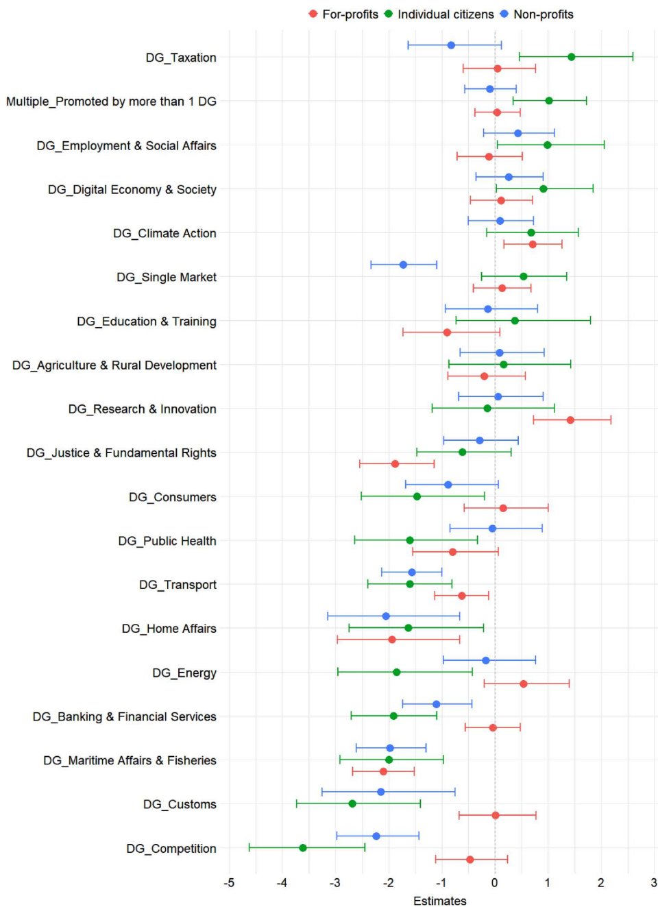
Figure 4. Citizen, non-profit, and for-profit organizational engagement, by DG. Note: Citizens: N = 178; AIC = 2,187/Non-profits: N = 152; AIC = 1,377/For-profits: N = 165; AIC = 1833. Coefficients shown are the estimates from negative binomial regressions on engagement by citizens (green, middle value), non-profit (blue, upper value), and for-profit organizations (red, bottom value), including their 90% confidence intervals and using DG Environment as reference category. OPCs were included if a breakdown of response rates by organizational type was available for DGs with at least four data points.