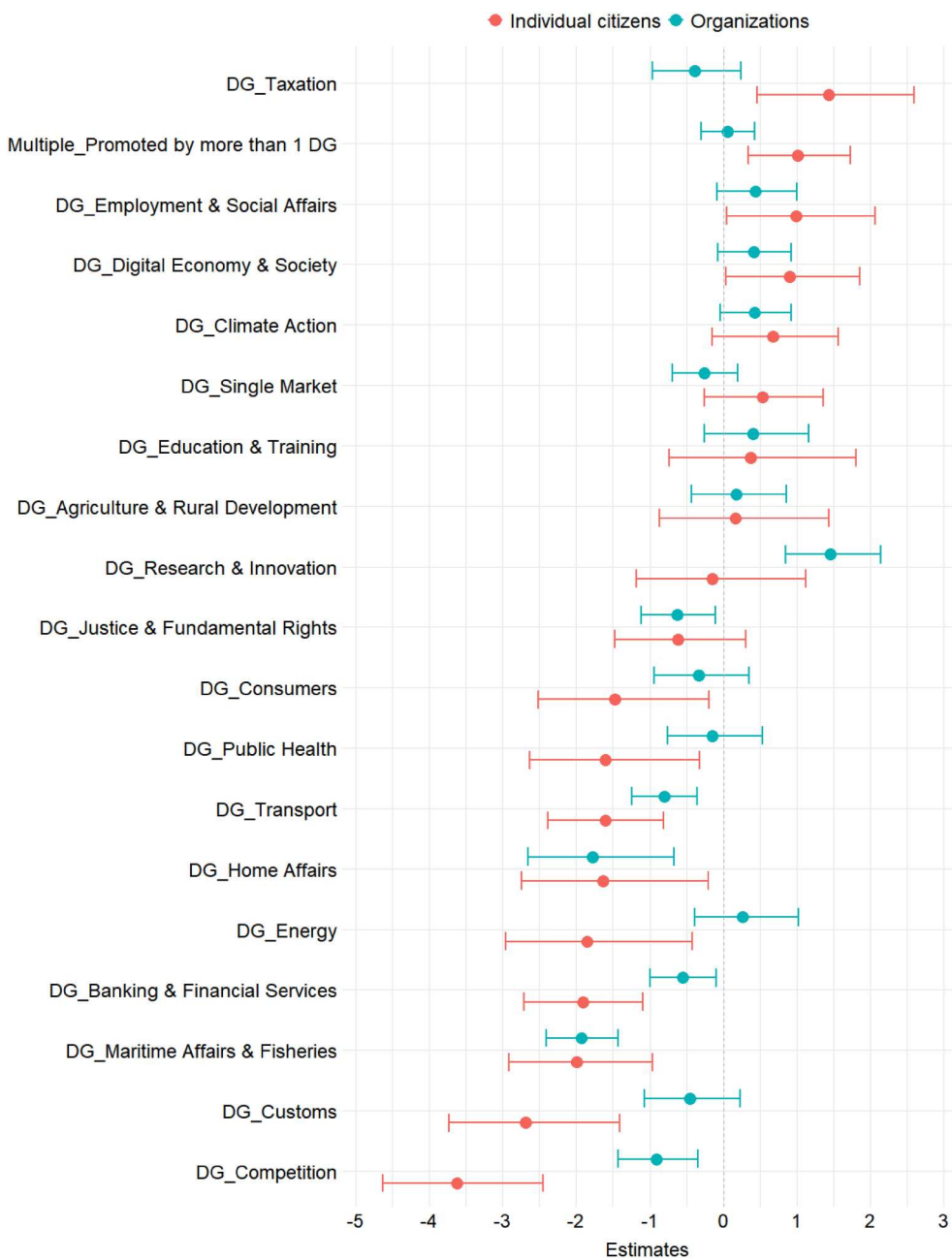
Figure 3. Citizen and organizational engagement in OPCs, by DG.

Note: Citizens: N = 178 ; AIC = 2,187/Organizations: N = 188 ; AIC = 2,339. Coefficients shown are the estimates of a negative binomial regression on citizen engagement (red, bottom value) and organizational engagement (blue, upper value), including their 90% confidence intervals and using DG Environment as reference category. For reasons of parsimony and relevance, only DGs are displayed if information about citizen engagement in their respective OPCs was available for at least four OPCs.