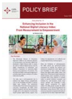
Enhancing Inclusion in the National Digital Literacy Index: From Measurement to Empowerment