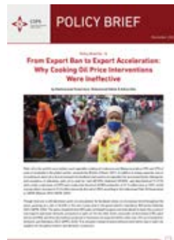
From Export Ban to Export Acceleration: Why Cooking Oil Price Interventions Were Ineffective