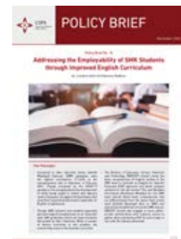
Addressing the Employability of SMK Students through Improved English Curriculum