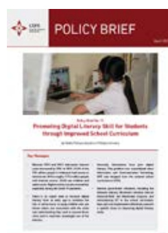
Promoting Digital Literacy Skill for Students through Improved School Curriculum