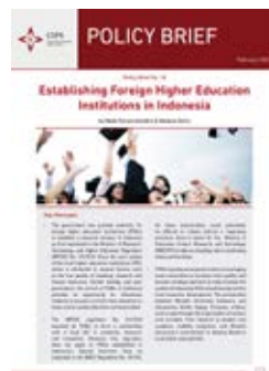
Establishing Foreign Higher Education Institutions in Indonesia