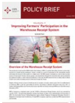
Improving Farmer's Participation in the Warehouse Receipt System