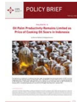
Oil Palm Productivity Remains Limited as Price of Cooking Oil Soars in Indonesia