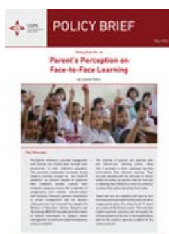
Parent's Perception on Face-to-Face Learning