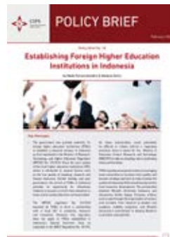
Establishing Foreign Higher Education Institutions in Indonesia