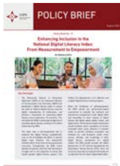
Enhancing Inclusion in the National Digital Literacy Index: From Measurement to Empowerment