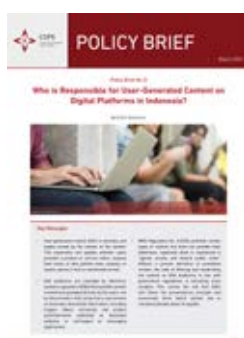
Who is Responsible for User- Generated Content on Digital Platforms in Indonesia?