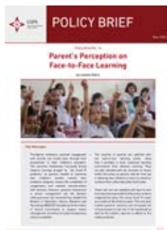
Parent's Perception on Face-to-Face Learning