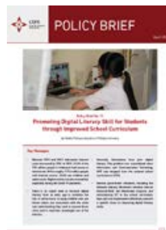
Promoting Digital Literacy Skill for Students through Improved School Curriculum