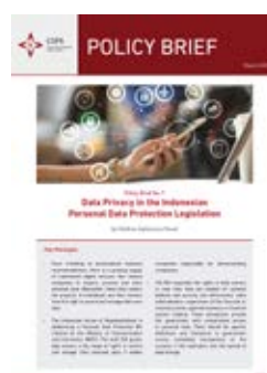
Data Privacy in the Indonesian Personal Data Protection Legislation