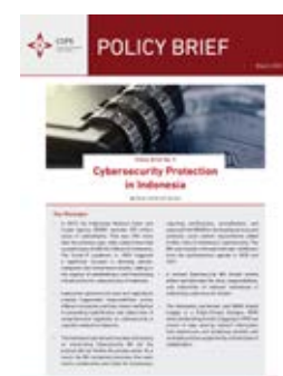
Cybersecurity Protection in Indonesia

Go to our website to access more titles: