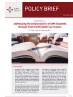
Addressing the Employability of SMK Students through Improved English Curriculum