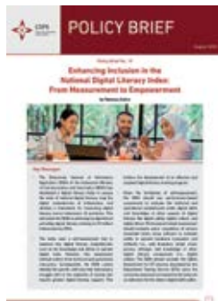
Enhancing Inclusion in the National Digital Literacy Index: From Measurement to Empowerment