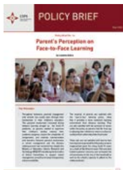
Parent's Perception on Face-to-Face Learning