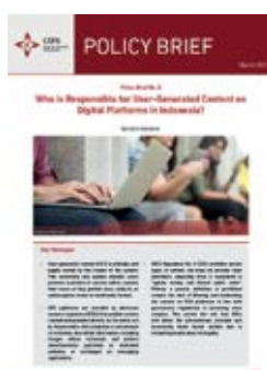
Who is Responsible for User- Generated Content on Digital Platforms in Indonesia?