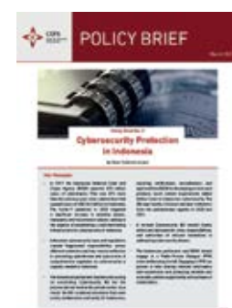
Cybersecurity Protection in Indonesia

Go to our website to access more titles: