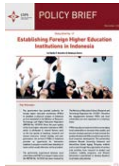
Establishing Foreign Higher Education Institutions in Indonesia