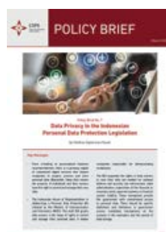
Data Privacy in the Indonesian Personal Data Protection Legislation