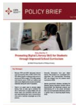
Promoting Digital Literacy Skill for Students through Improved School Curriculum