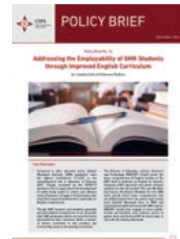
Addressing the Employability of SMK Students through Improved English Curriculum