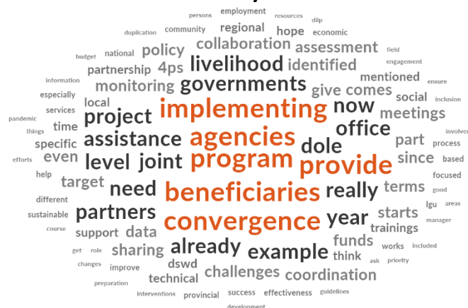
Figure 4. DSWD-DOLE KII Word Cloud Summary