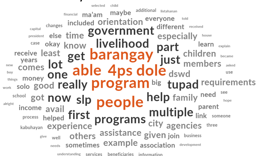
Figure 5. FGD Word Cloud Summary