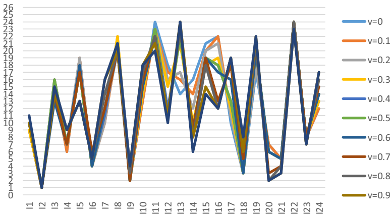
Figure 3. Sensitivity analysis of rankings