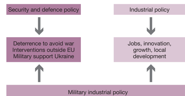
Figure 3 Conceptualising defence/military industrial policy

Designing a defence industrial policy at the EU level is complicated even more by the institutional separation between industrial policies and security and defence