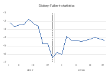
Chicago-Medium Price Tier