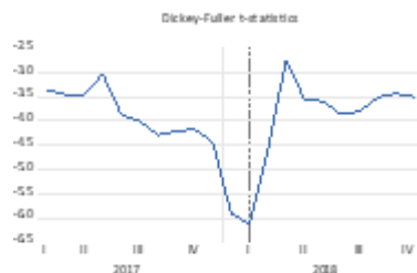
Washington DC-Medium Price Tier