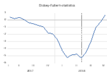
San Diego-Medium Price Tier