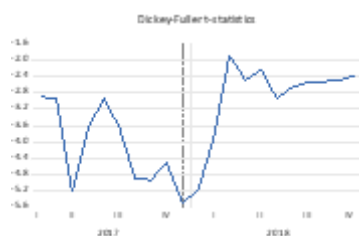
Atlanta-Low Price Tier