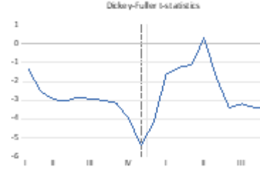
Phoenix-Low Price Tier