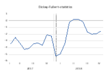
Phoenix-Medium Price Tier