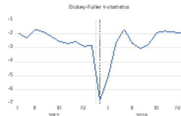
New York-Medium Price Tier