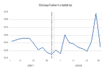
Washington DC-Low Price Tier