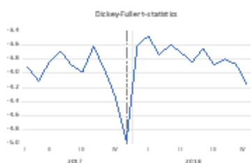
Atlanta-High Price Tier