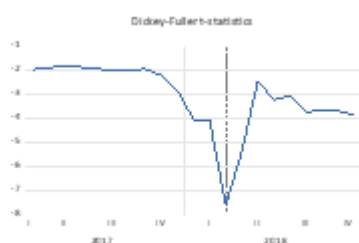
Boston-High Price Tier