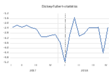
Chicago-Low Price Tier