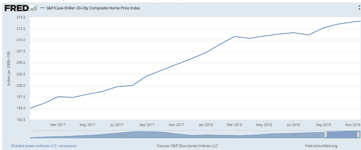
Figure 1: Case-Shiller 20-City Composite Home Price Index, 2017–2018.