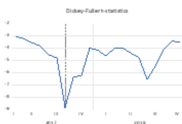
Miami-High Price Tier