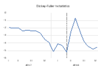
Seattle-Medium Price Tier