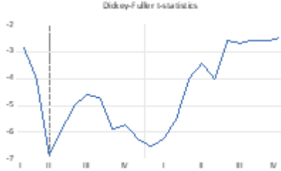
Miami-Low Price Tier