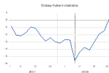
Seattle-High Price Tier