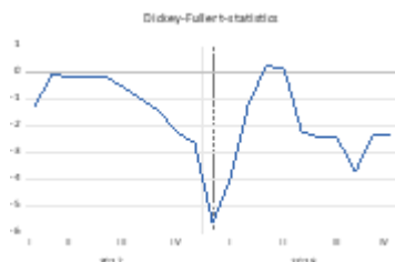
Los Angeles-Low Price Tier