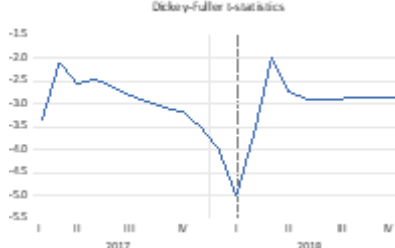
Minneapolis-High Price Tier