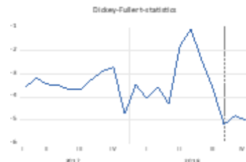
Seattle-Low Price Tier