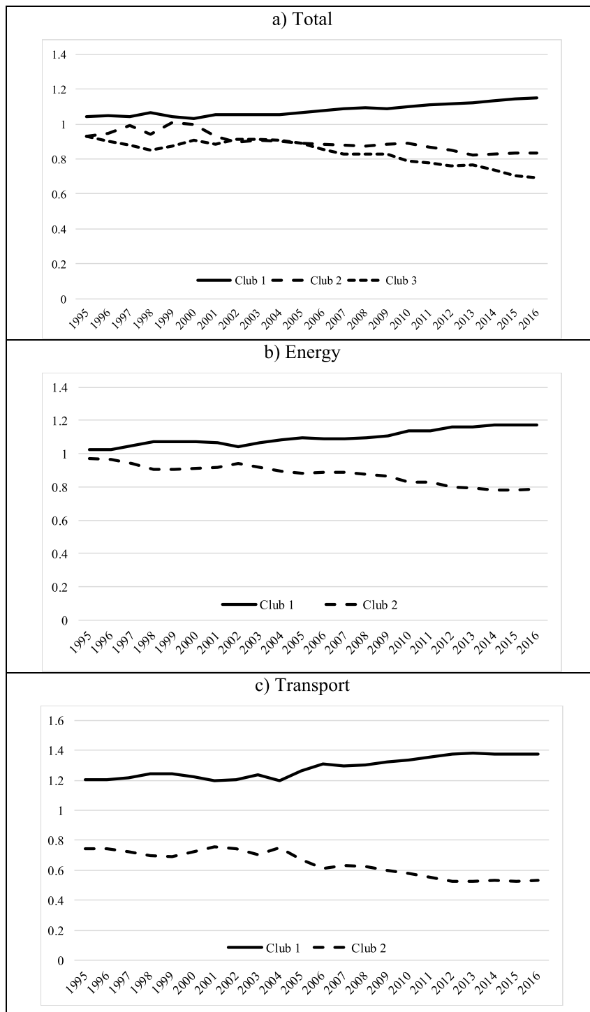
Fig. 2. Average relative transition curve for each club - %GDP.