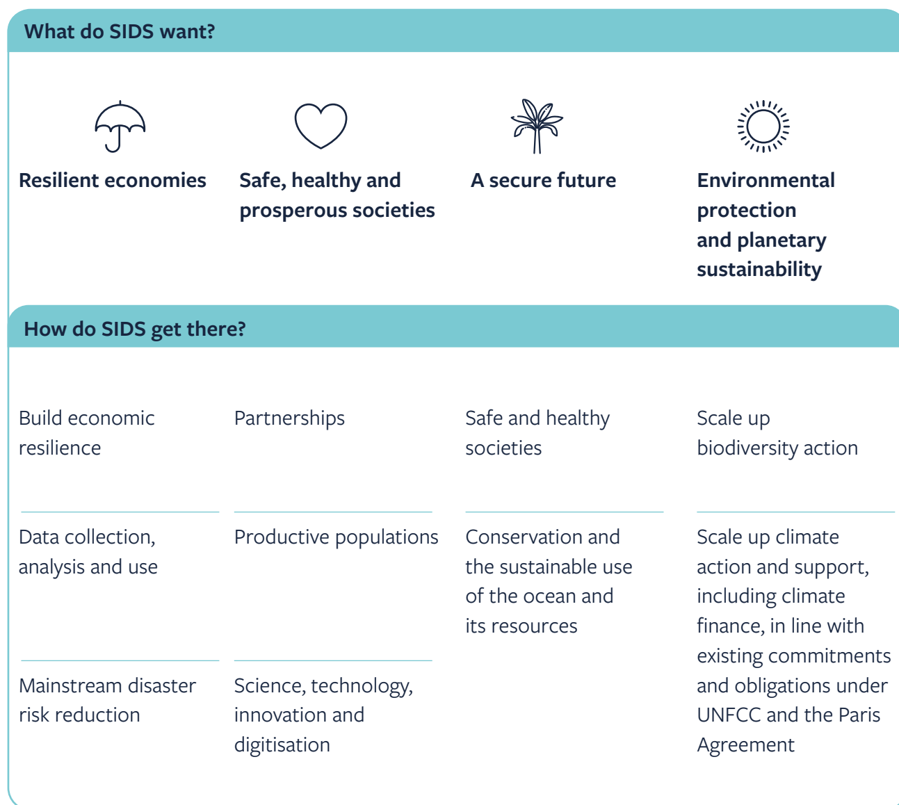
Figure 3 Summary of ABAS document