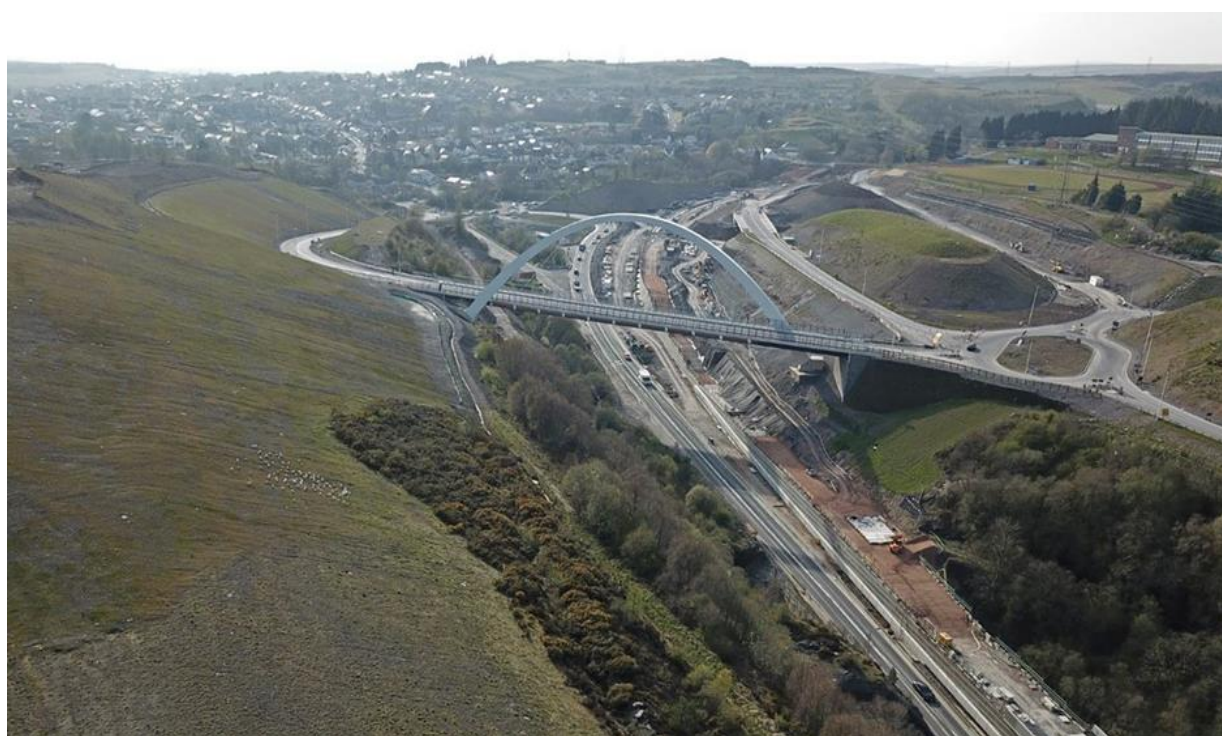
Figure 1: Aerial view of part of the A465 Section 2 works

The aim of the scheme is to upgrade the existing three-lane carriageway to a two-lane dual carriageway to improve the safety of a notoriously dangerous road. Figure 1 shows an aerial view of part of the A465 Section 2 works. The Jack Williams Gateway Bridge shown in Figure 1 has since been completed and was opened to traffic in 2018. The bridge is named after a local World War One hero.