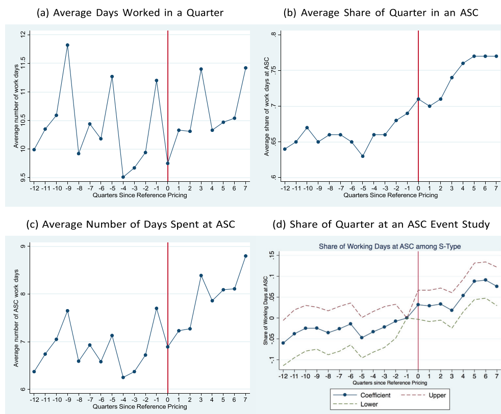
Figure 2. Work day variation among physicians. Figure 2a presents the average number of days worked in an ASC for physicians in the quarters since reference pricing. Figure 2b presents the average share of days worked at an ASC in a given quarter. Figure 2c presents the average number of days worked in an ASC in the quarters since reference pricing. Figure 2d presents estimates of the added share of working days spent at an ASC in a given quarter, in comparison to the quarter before the reform is introduced, which has been benchmarked to zero. Data is from colonoscopy patient who visits to Splitter physicians (i.e., physicians who work at both hospitals and Ambulatory Surgery Centers in 2011).

(i.e., quarters since reference pricing equal to -9, -5, -1, 3, 7 ) among physicians. This pattern appears to be consistent over time and does not seem to vary over the pre- and post-reference pricing period, which suggests that the number of days worked by physicians has not been impacted by the policy.