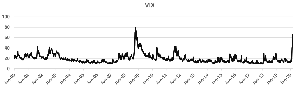
Figure 1. The VIX index.