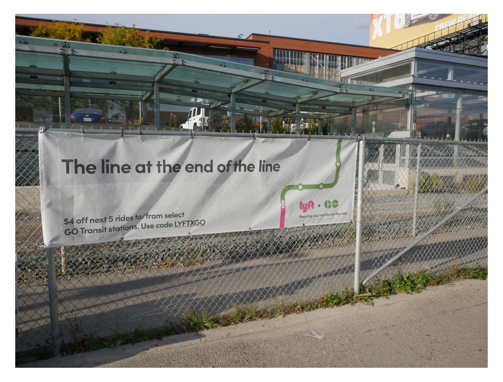
FIGURE 3 An advertisement for the Lyft-Metrolinx pilot at the Exhibition station in downtown Toronto (photo by the author, October 2019)

parking spaces. A few thousand new customers that wouldn't otherwise be able to get there' (interview with Metrolinx planner, 5 November 2018). From the perspective of Metrolinx, the pilot was a viable way to test Lyft's ridehailing services as a potential solution to mounting capacity problems at particularly busy rail stations.