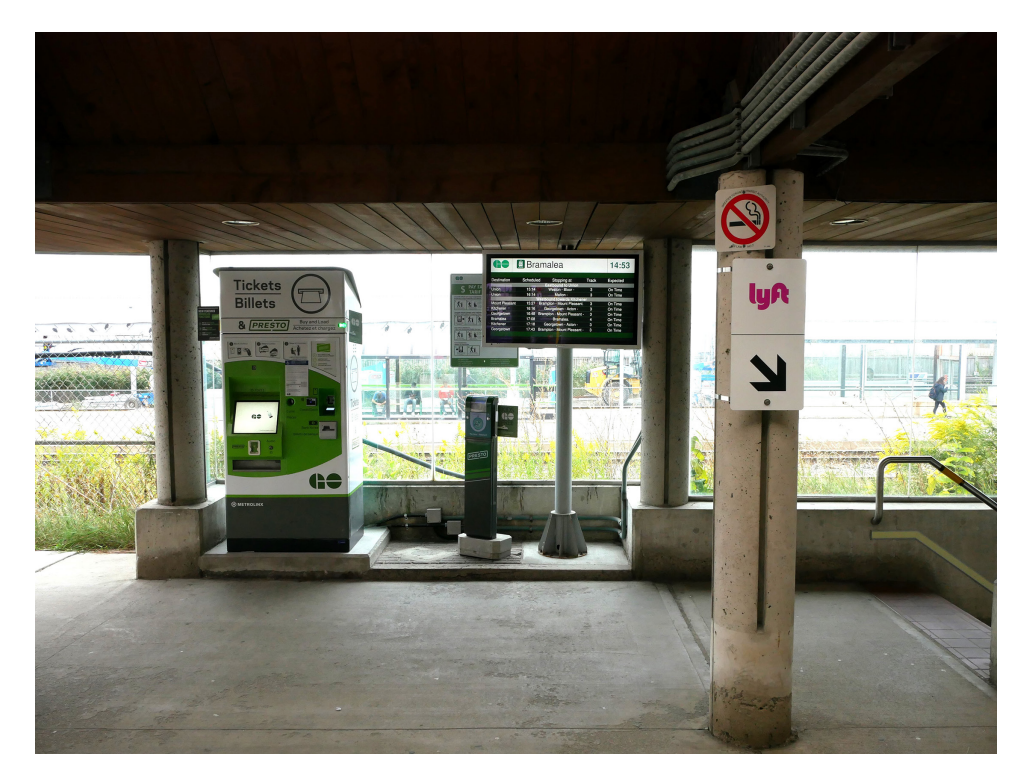
FIGURE 4 A Lyft signpost at Bramalea GO Station, which directs passengers to a designated pick-up/drop-off zone at the station's parking lot

centrality to the nodal growth development of Places to Grow and, much in line with the latter, the GO Rail Expansion program.