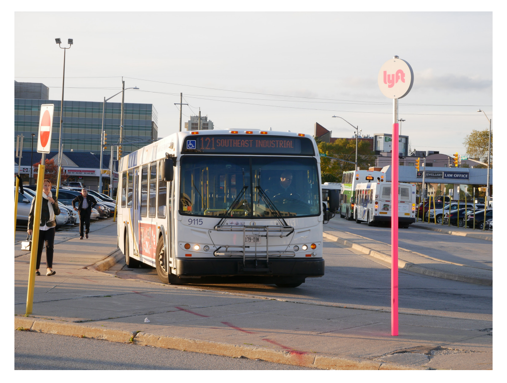
FIGURE 1 Lyft signpost at Oakville GO rail station marking one of several designated pick-up/drop-off areas at the station

wider extent: the vast network, reaching deep into Toronto's sub- and exurban hinterlands, of the city's regional transport system.