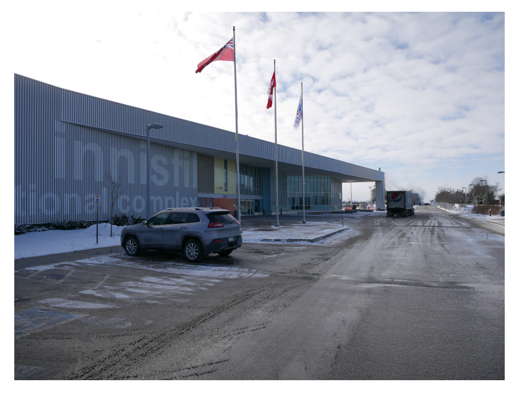
FIGURE 5 The Innisfil Recreational Complex forms one of Innisfil Transit's local sites that guarantees a fixed fare of CAN $4 ($3 at the start of the partnership) (photo by the author, December 2018)

who relied on the program most heavily—using Uber, for instance, to commute to work on weekdays—ran out of ride credits halfway through the month (Bliss, 2019; Cecco, 2019). Not only had the costs for Innisfil Transit exploded, but the scheme had also undermined its initial key promise of on-demand, round-the-clock availability for Innisfil's 'transit' users. In place of a fixed-route bus system's spatial inflexibility, Innisfil Transit imposed a system of strict numerical rigidity: 30 trips per month.