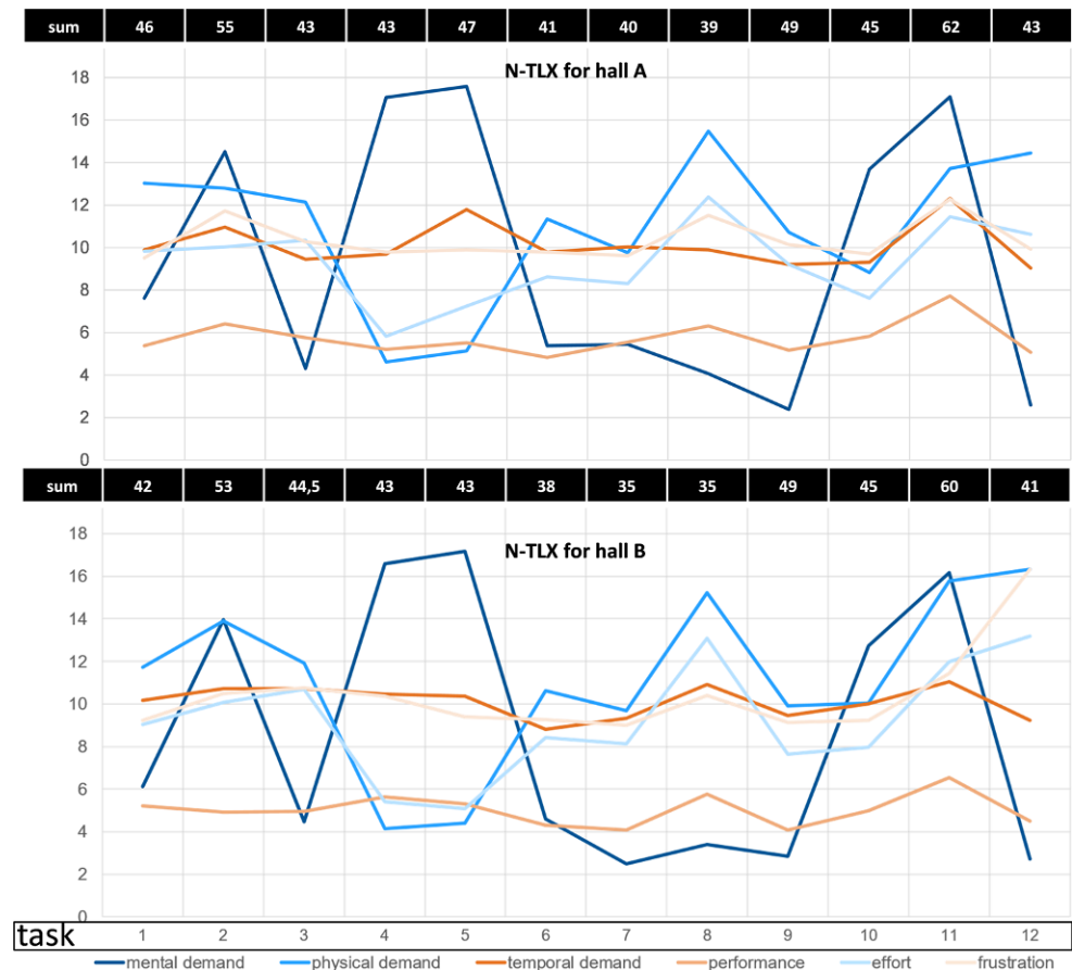
Abb. 2 N-TLX aufgeschlüsselt nach Halle

mended to abandon Borg for similar studies as there is no clear added value.