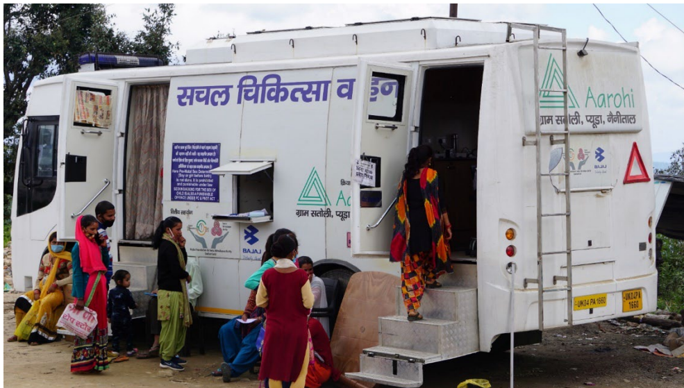
Figure A2: Aarohi's mobile medical unit, 2024

Before the introduction of MMUs, women in the Kumaon region had to undertake arduous journeys, often lasting over five hours, to reach the nearest healthcare facilities. Aarohi's MMUs now serve approximately 400 to 500 patients monthly across 127 villages in Ramgarh, Dhari and Okhalkhanda blocks of the Nainital district. These efforts have led to a significant improvement in maternal health outcomes and a broader understanding and adoption of essential health practices among local women.