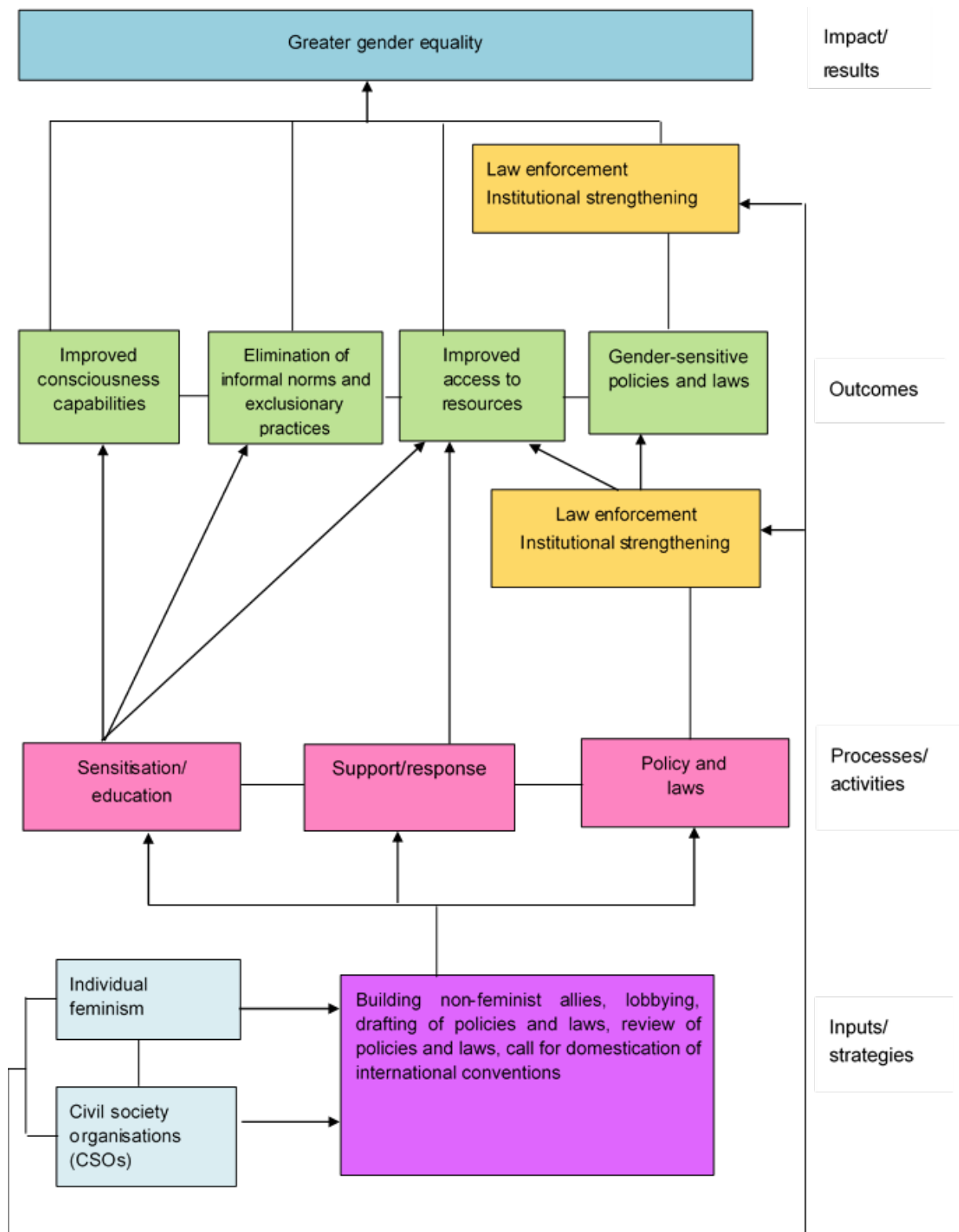
Figure 2: Theory of change