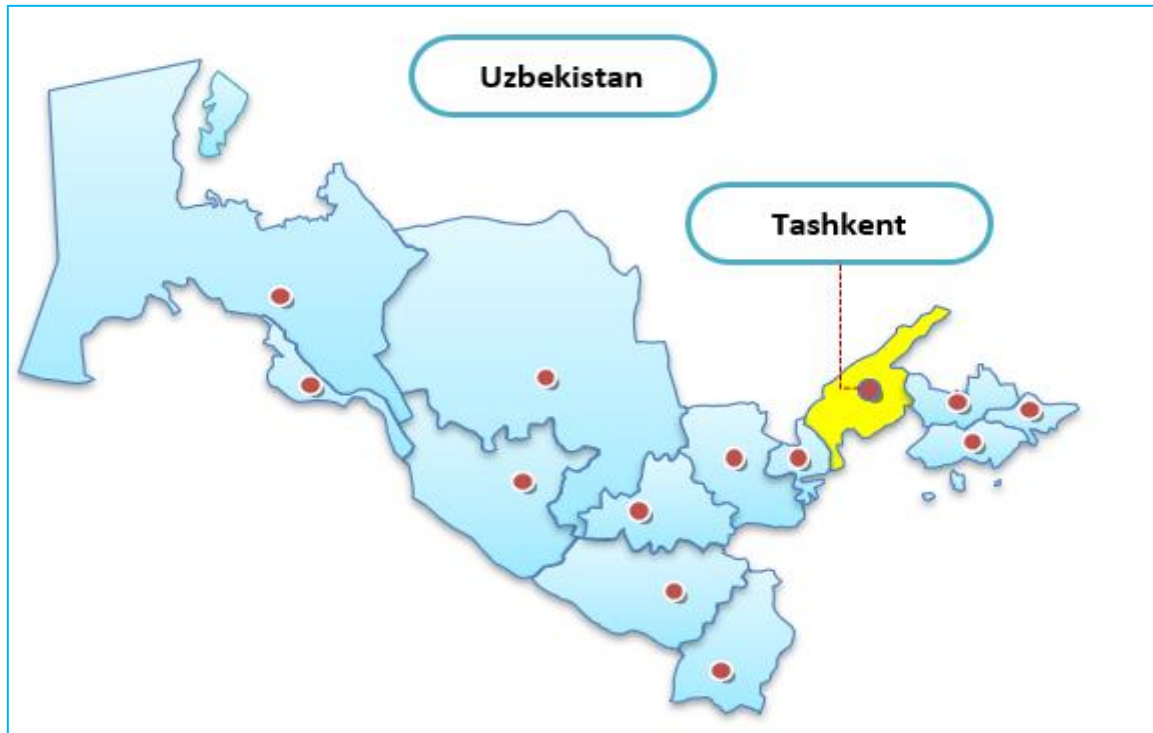
Figure 1. Map of study areas of Uzbekistan.