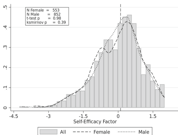
Fig. 1 Distribution of self-efficacy. Notes: Based on factor analysis, the figure shows the density distributions for the full sample, and for female and male entrepreneurs separately. The dashed vertical line represents the cutoff between entrepreneurs who score high (above median, to the right) and low (to the left) on the self-efficacy factor for the whole sample. Kernel distributions use an Epanechnikov function with a bandwidth of 0.2. Figure also reports p -values for t -test and ksmirnov -test of equal means and equal distributions between female and male entrepreneurs, respectively

vs. 5.06) than women, women are significantly more likely to believe that they “stick to aims and accomplish goals” (item 3: 5.26 vs. 5.14), “they can handle any situation they face” (item 6: 5.63 vs. 5.41), and “they find several solutions to problems” (item 7: 5.41 vs. 5.27), compared to men. For the other three items, there are no significant differences between the genders. When taking the average over all items together (self-efficacy index), we also do not find a significant difference ( p -value: 0.95) between men (5.34) and women (5.36). Figure 1 and the corresponding Kolmogorov-Smirnov-test on the equality of distributions ( p -value: 0.39) show that this is true for the mean and for the distribution. Nevertheless, we account for potential gender differences in our heterogeneity analysis in Section 4.4 by standardizing the self-efficacy factor as well as generating dichotomous indicators separately within both sub-samples.