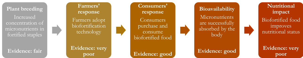
Fig. 2 Simple theory of change and evidence of impacts of biofortification interventions.

force of this development was the search of new sources of profits by dairy processors responding to changing consumer demands and price sensitivity. The authors highlight that in the context of weak market regulation, dairy processors were able to market unhealthy food products as healthy dairy products at very affordable prices to low-income consumers.