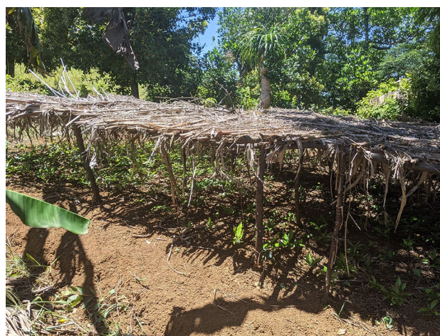
Fig. 3 Cloves nursery of one positive deviant household

Trying new crops or switching to a new variety bears risk, but better outcomes can reward this risk-taking in the long run. Encouraging farmer entrepreneurial orientation may play a role in implementing nutrition-sensitive development interventions. Several studies demonstrate the importance of entrepreneurship for the success and well-being of farmers. Development organizations can foster an environment conducive to farmer entrepreneurship, for example, by