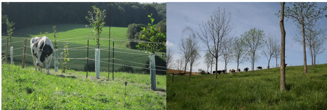
Figure 2: Young silvopastoral system. (left); Silvopastoral system with twenty-year-old black walnut trees. (right)

Note: Further pictures were shown to respondents.