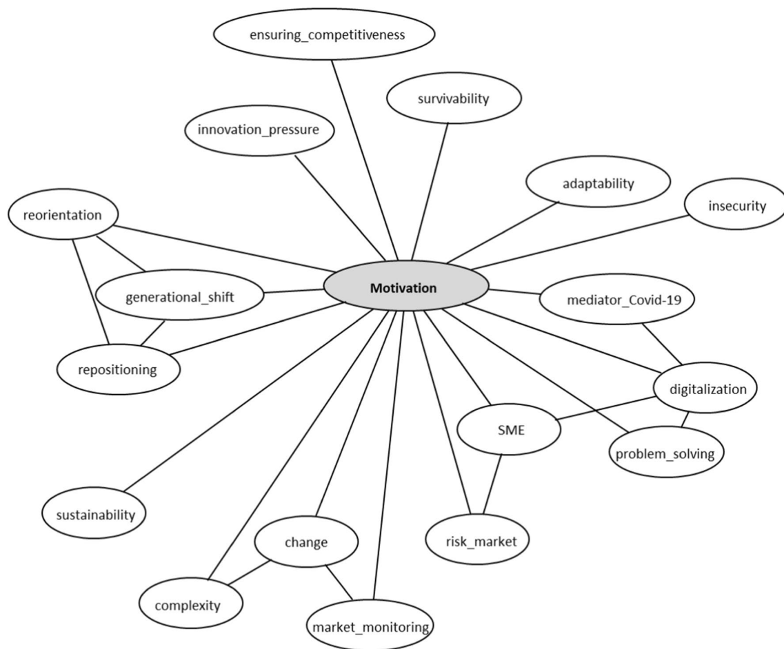
Fig.1 Motivations for business transformation (own elaboration)

thereby considered useful for the transformation of internal processes and structures.