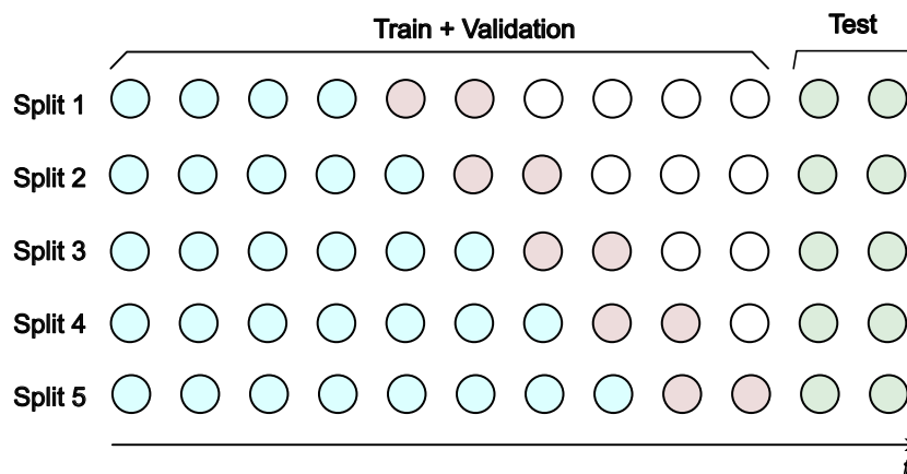
Figure 3: Walk Forward Cross Validation (5 folds)

Walk-Forward cross-validation, also known as time-series cross-validation, is designed specifically for time-series data, where the temporal order of observations must be preserved. In this method, the training set starts with a small subset of data and grows sequentially as more data becomes available. After each training iteration, the model is validated using the next time period. This iterative process mimics real-world nowcasting, where models are trained on past data to predict future outcomes. However, walk-forward cross-validation is less efficient in terms of data usage, as each iteration uses only a portion of the dataset for training and another portion for validation. This can lead to higher variance in performance estimates, particularly in early iterations when the training set is smaller.