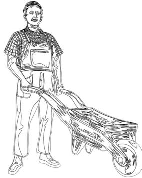
FIGURE 1.1B Agriculture