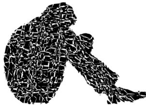
FIGURE 1.1D Cognitive Overload