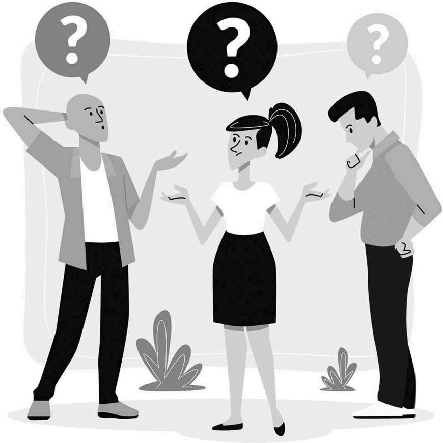
FIGURE II.1 Uncertainty