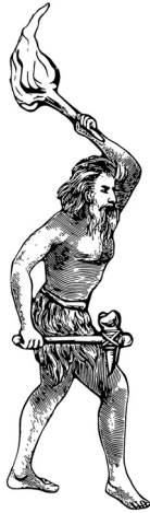
FIGURE 1.1A Hunter-gatherer