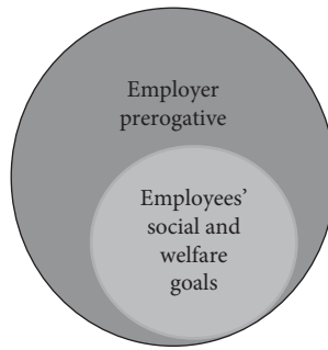
Figure 10.1 Employer prerogative to technologies in positive labour law

Employer prerogative covers various aspects of working life, starting from decisions on hiring and firing to determining the workers' wage rate and deciding and changing of the workplace organizational structure. Employers can define what employees wear and how they look; they can track workers' activities at and outside work due to the increasingly blurred boundaries separating work and private life; control their work environment, their work routine, hours of work, requests for working at home, and, hence impact on employees' work-life balance, etc. That is a partial list of all the things employers can do under their prerogative, but from the extent of this list, it is hard to find any justification for further strengthening such prerogative.