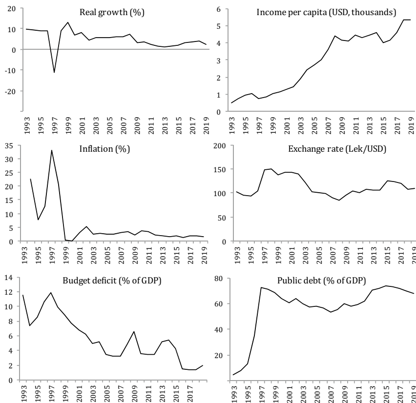
Fig. 1 Main macroeconomic indicators.

the aftermath of elections. These visually discerned cyclical patterns from the data reveal a plausible indication of an election-related effect.