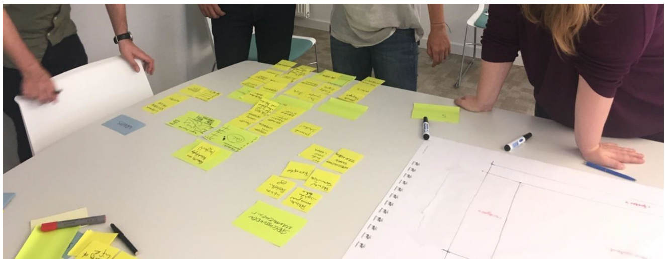
Fig. 1 Interface Sketching Workshop during the card sorting phase

The design task was to define the basic information architecture of the initial view of our dashboard. This included identifying the interface elements (pieces of information) that must be visible first. Hence, we needed to prioritize. To this end, we ran what we call an Interface Sketching Workshop where we cocreated with our users.