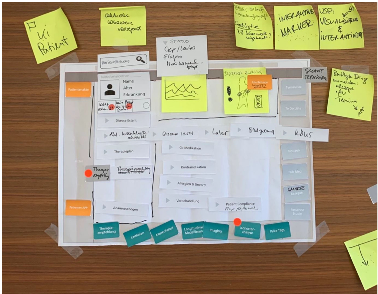
Fig. 2 User-generated interface design solution serving as the basis for professional design ideation