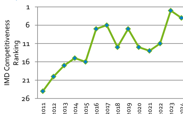
Figure 1: Ireland's IMD Competitiveness Ranking 2011-2024

Ireland's competitiveness ranking fell two positions from 2 nd place to 4 th place in the latest assessment. Ireland continues to rank among the most competitive economies globally, with this year's ranking the second year Ireland has ranked in the Top 5 economies. Ireland has consistently been placed in the top 20 most competitive economies globally since 2012 (Figure 1).