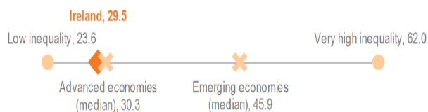
Figure 3. Gini Co-efficient of income inequality (Ireland and selected others)

The Gini co-efficient is a measure of equality of income in the population where a score of zero represents a situation where all households have equal income and 100 represents a situation where one household accounts for all national income.