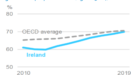
Figure 2. Employment rate (aged 15-64)

Ireland's employment rate (i.e., the proportion of the working age population in employment) is currently in line with that of the OECD but was increasing more rapidly prior to the onset of the COVID-19 pandemic.